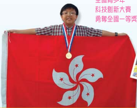
全國青少年 科技創新大賽 勇奪全國一等獎

除了六天緊湊的比賽外，我也有機會在大草原生活了兩天。早上，騎着馬在草原上踱步，感受到當地簡樸的生活，體會當地居民濃濃的人情味；晚上，感受無數星宿的偉大，實在是一個奇妙的旅程。